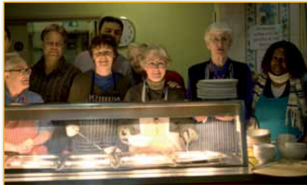
Volunteers serve 250 meals daily

With your support The Passage, inspired by our Vincentian values, continues to help some of London's most needy. We offer non-judgemental advice and support and practical long term solutions to the complexities of homelessness. At the same time, The Passage strives to empower the whole person, help him or her to discover their own riches, their gifts, so that they become truly independent and able to lead their own lives.