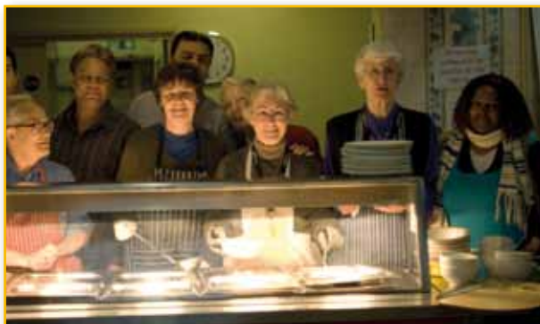
Volunteers serve 250 meals daily

With your support The Passage, inspired by our Vincentian values, continues to help some of London's most needy. We offer non-judgemental advice and support and practical long term solutions to the complexities of homelessness. At the same time, The Passage strives to empower the whole person, help him or her to discover their own riches, their gifts, so that they become truly independent and able to lead their own lives.